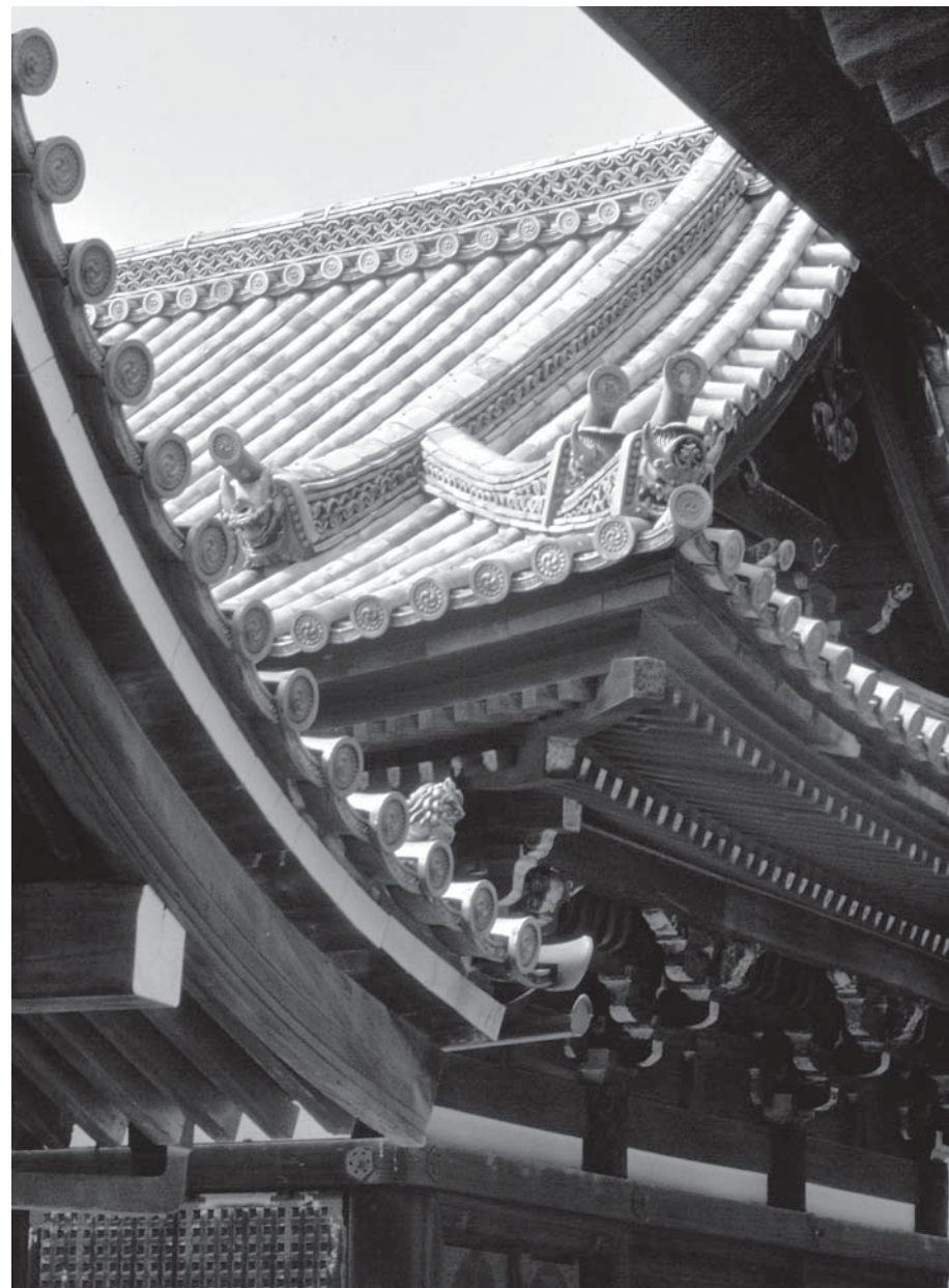
Trods de graciøst svungne linjer er tempel-arkitekturens tagvolumener ganske tunge. Først med te-æstetikken blev letheden en del af det japanske arkitekturudtryk