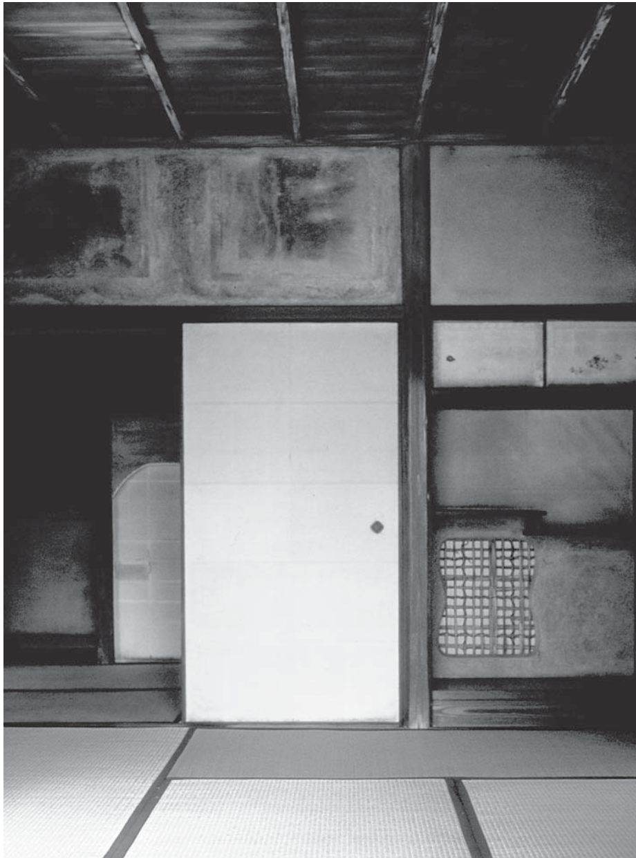
Shokin-tei, forbindelsen mellem soan-chasbitsu og tilliggende rum. Det græskarformede sbitaji-mado giver sidelys ved te-rummets daime-mätte