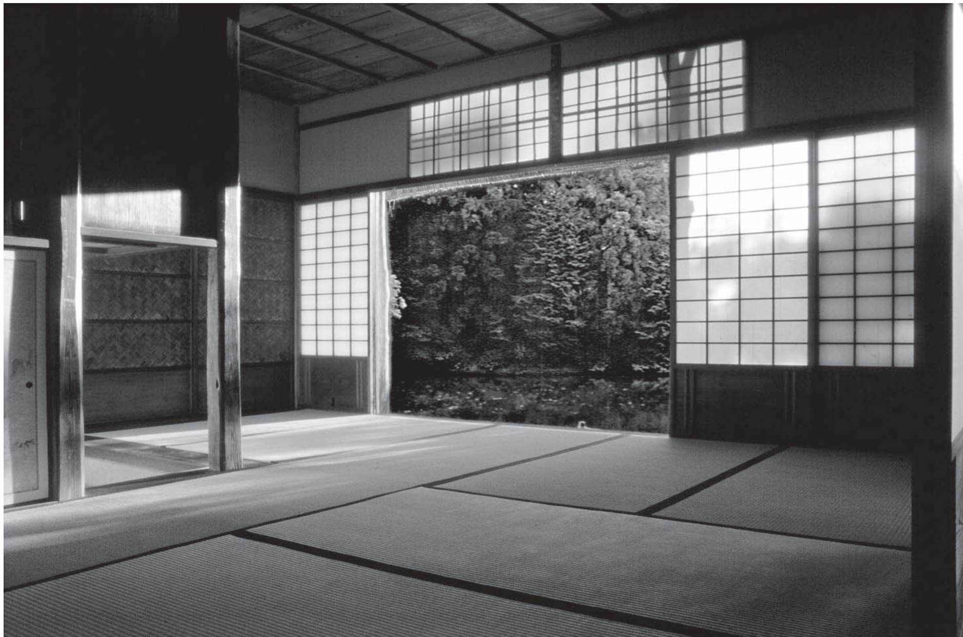
Shokin-teis største rum, set mod vestgavlen i lavt indfaldende eftermiddagslys. Udsigten, som frontalt har stor dybde (se ill. p.375), forsvinder mod venstre ind i Ildflueslugtens tætnende mørke