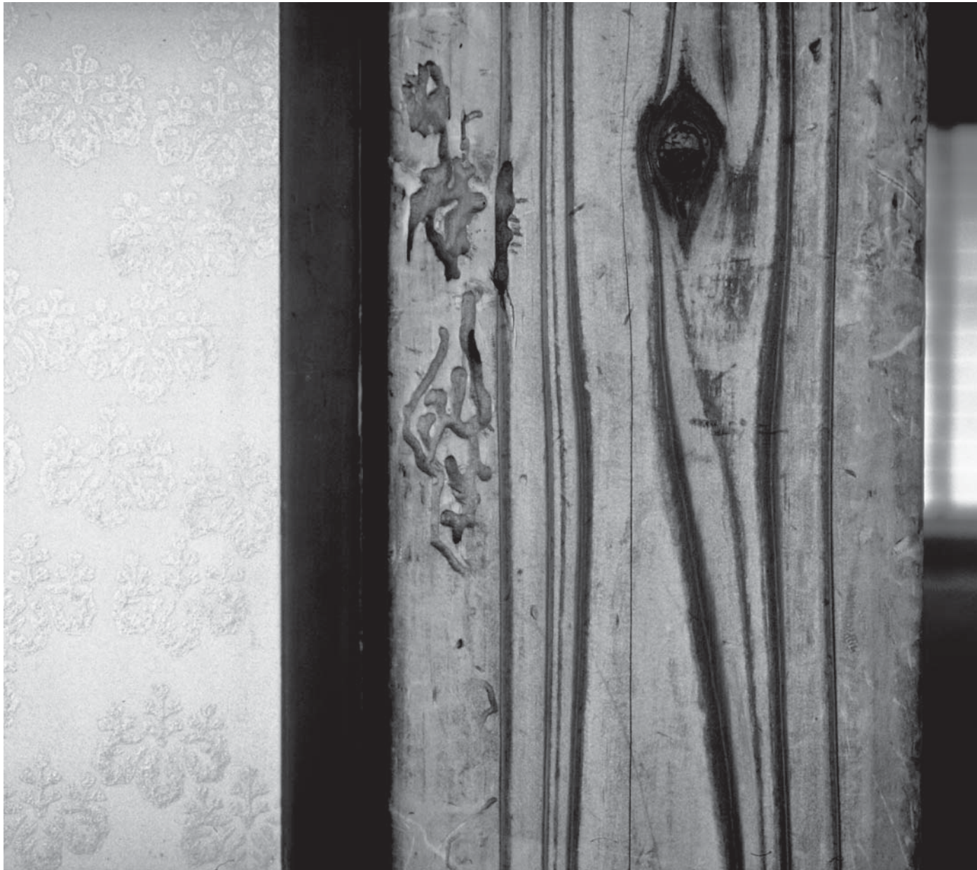
Detalje af søjle i Shin-goten, den nyeste fløj i Katsura Rikyus sboin-bygning