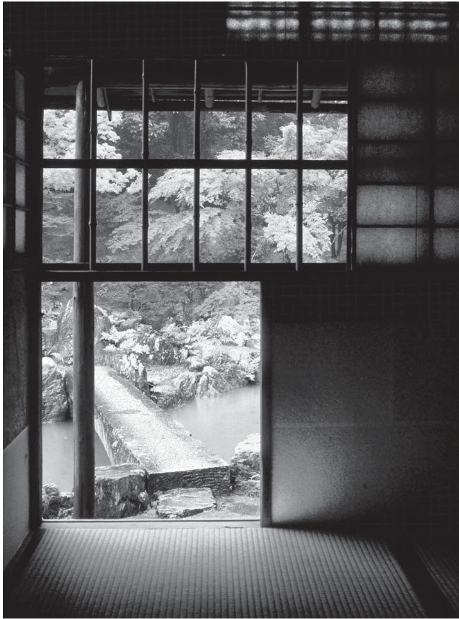
Shirakawa-broen, som leder til Shokin-tei, set gennem Shokin-teis nijiri-guchi