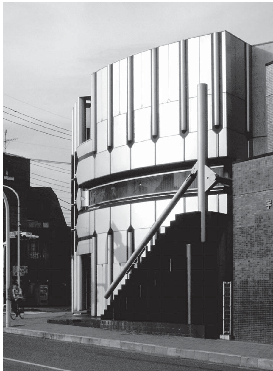
Shin Takamatsu: Wako Headquarters Building, Ome, Tokyo (1989)