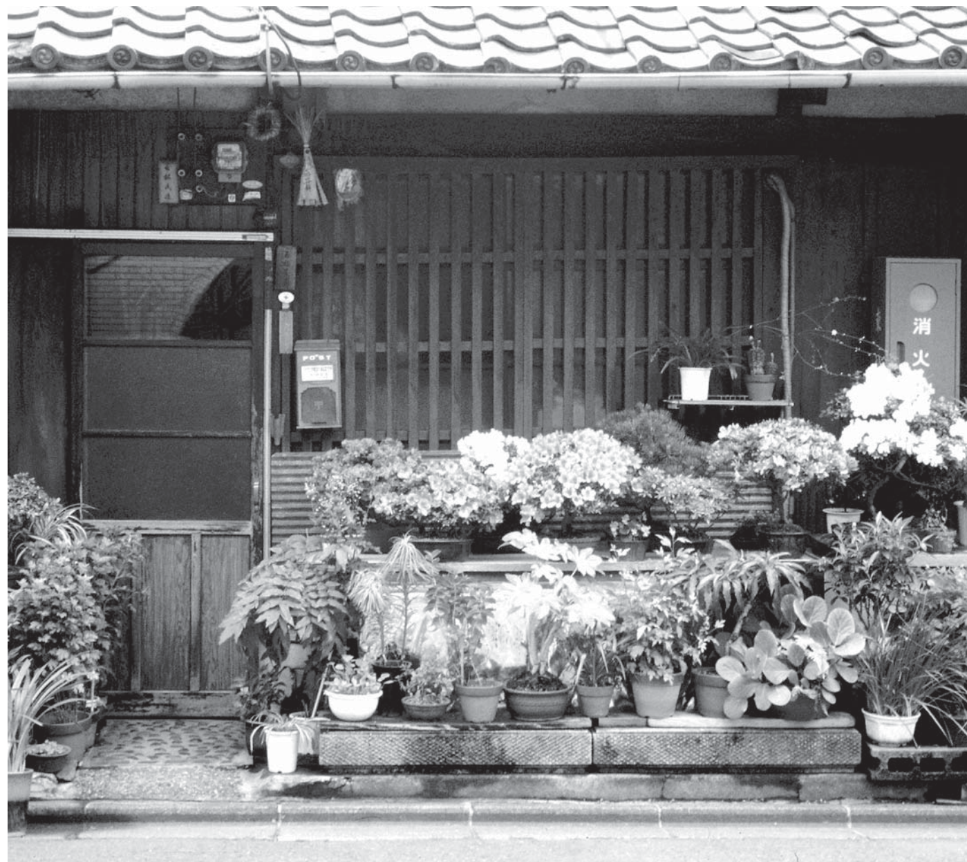
Typisk Nishijin-facade. I machinami-kvarterernes snævre gader bar den smalle zone mellem bus og gade ofte et næsten dagligstueagtigt præg