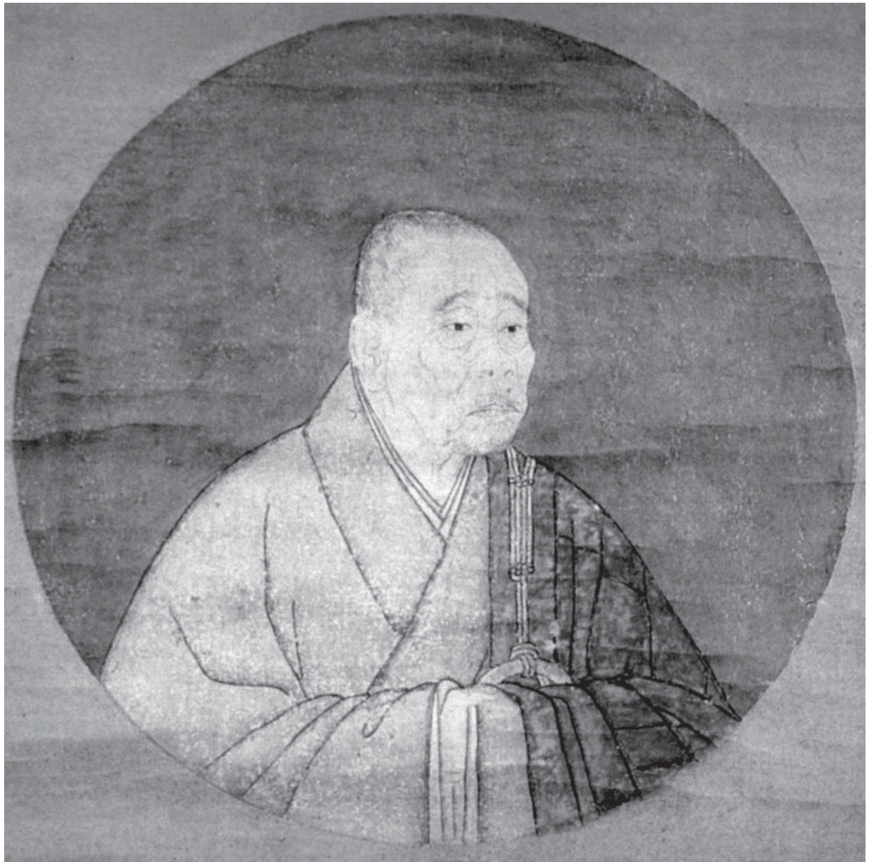
Portræt af Ikkyū Sojun (1394-1481), den zen-mester, som zen-templet Shinju-an er grundlagt for. Portrættet er et udsnit af et dobbeltportræt, malet i 1478 af en af Soga-skolens malere. Det fulde billede er gengivet p. 274